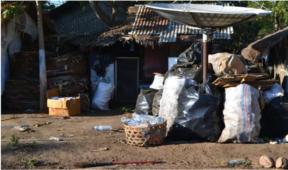
Figure 2. Condition of Bintang Sejahtera WB.