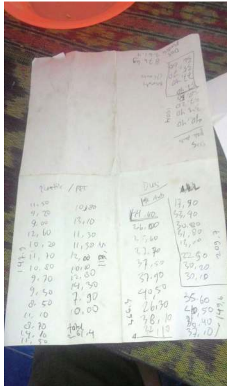
Figure 4. Waste record and list in Bintang Sejahtera WB.

period. The operational time of WB is 8 h accommodating four activities, i.e., waste separation, waste compacting, waste weighing, and data recording. The time allocated for each activity is 4 h, 2 h, 15 min, and 5 min for separation, waste compacting, waste weighing, and data recording, respectively, and an additional 1 h for lunch break.