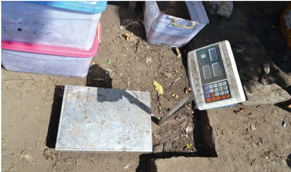
Figure 3. Weighing the waste in Bintang Sejahtera WB.

lager as a member of WB when it is needed. Bintang Sejahtera WB has cooperation with the environmental community initiative to collect waste from beaches and with the local government to provide collection system to transport the waste. It also offers seminars and trainings for local people in terms of waste treatment (composting and reuse-reduce-recycle method).