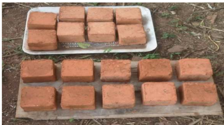
Figure 11. Samples of nonconventional clay bricks. Source: [33].

Tiles are hard-wearing thin, flat slabs or blocks typically made from porcelain, fired clay or ceramic with a hard glaze or other materials such as glass, metal, cork and stone. They