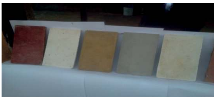
Figure 14. Samples of cement-bonded Cissus populnea fibre-reinforced floor tiles produced. Source: [41].