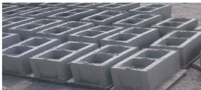
Figure 2. Freshly manufactured concrete hollow blocks.

Concrete hollow blocks ( Figure 2 ) and unfired clay bricks ( Figure 3 ) are two of the predominant conventional materials for the construction of houses in Nigeria. Concrete hollow blocks manufactured in a factory or on-site made of Portland cement and sand in a ratio of 1:8, and more commonly used in the urban and peri-urban areas, are usually rectangular, often 45 cm