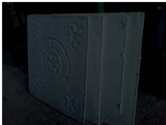
Figure 10. Made-in-Nigeria wastepaper-cement composite ceiling boards.