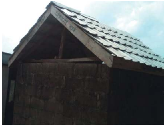
Figure 6. Fibre-reinforced composite roofing tiles installed on a gable-roofed building in Ibadan, Nigeria. Source: [23].