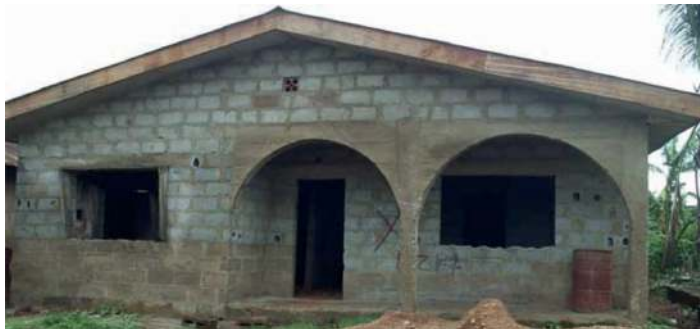
Figure 4. A typical building under construction using concrete hollow blocks.

wide, 15 cm thick and 30 cm high and yellow/whitish in colour. The hollows tend to run from top to bottom and occupy about two-thirds of the volume of the block [5]. The blocks are usually joined together with mortar in building construction as shown in Figure 4 .