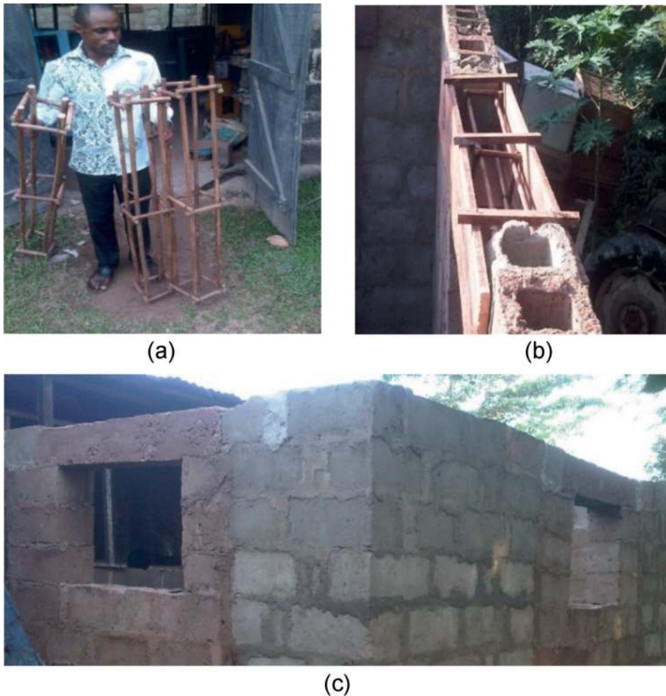
Figure 15. (a) Rattan cane reinforcement, (b) lintel beam casting in progress, (c) the cured concrete lintel beam after 28 days.

The potential use of oil palm ( Elaeis guineensis ) stem as reinforcement in concrete was also confirmed [46] as well as the suitability of rattan cane in reinforced concrete lintel beam fabrication in rural building construction in Nigeria [30]. The concrete lintel beam dimensions were 0.23 \text{ m} \times 0.254 \text{ m} \times 1.37 \text{ m} , while the mean diameter of the rattan cane stems was 30 mm. They were soaked in water for 24 h to ensure flexibility, manually straightened and cut into 4 long (1300 mm) and 12 short (187 mm) pieces. The short pieces were tied to the long ones as stirrup with binding wires, sun-dried for 2 days to about 15% moisture content and then placed in the formwork for casting three 0.23 \text{ m} \times 0.254 \text{ m} \times 1.37 \text{ m} concrete lintel beams ( Figures 15a,b ). The cement content of the concrete was partially replaced with 20% RHA to reduce the alkalinity. After 28 days post-casting operation, the formwork was removed, and it was observed that the lintel was straight with no sign of deformation ( Figure 15c ). Hence, it was successfully demonstrated that rattan canes with diameters ranging from 26 to 31.5 mm could be used as alternative to steel in lintel construction with up to 54% reduction in production cost.