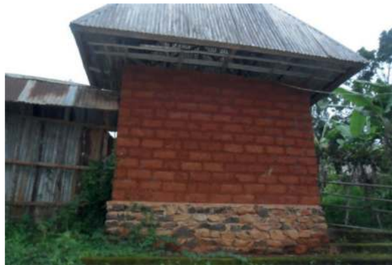
Figure 3. A typical building constructed using clay bricks.