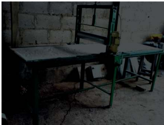
Figure 8. Made-in-Nigeria ceiling board-making machine. Source: [16].