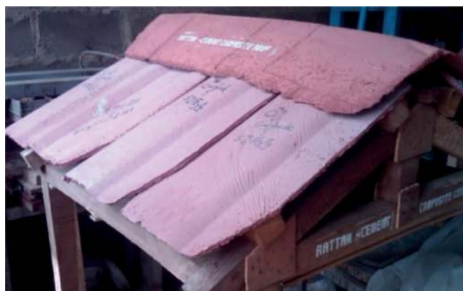
Figure 5. A prototype roof fabricated from rattan-cement composite tiles.

In a departure from the use of ordinary Portland cement alone as the binder, the production of clay-cement-sawdust composite roofing tiles using sawdust derived from teak ( Tectona grandis ) and wood ash as a partial replacement for cement was investigated [32]. The basic properties of the lateritic clay material used are presented in Table 3 , while the properties of the tiles produced are presented in Table 4 . Partial replacement of ordinary Portland cement with about 10% of wood ash was found very acceptable in producing composite roofing tiles with relatively good bending strength, while partial replacement of cement with between 20 and 30% of wood ash reduced the thermal conductivity of the composite roofing tiles to acceptable levels.