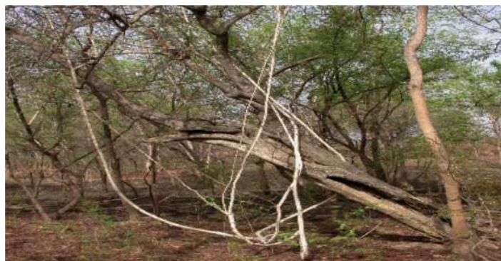
Figure 12. Cissus populnea shrubs.

A manually operated machine for the manufacture of Cissus fibre-reinforced cement-bonded composite floor tiles ( Figure 13 ) was developed and used to produce 200 (length) × 100 (width) × 10.5 mm (thickness) tiles of different colours—white, red, yellow, blue, green, black and grey ( Figure 14 ) [41]. The average mass per unit area was 25.5 kg/m 2 . The impact energy absorption capacity of the composite tiles (2943 Nmm) was relatively lower than that of a typical ceramic tile (3746 Nmm). However, the fibre-reinforced tiles had much lower water absorption of 7% than 12% for a typical ceramic tile at after 24 h of soaking in cold water, while both types of tiles had the same thickness swelling of 3%.