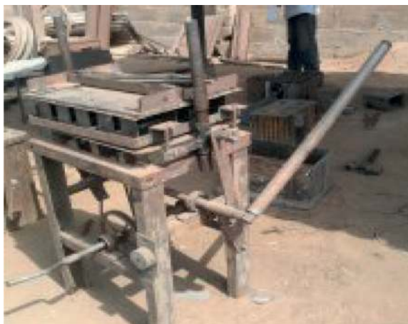
Figure 13. Side view of the tile-making machine. Source: [41].