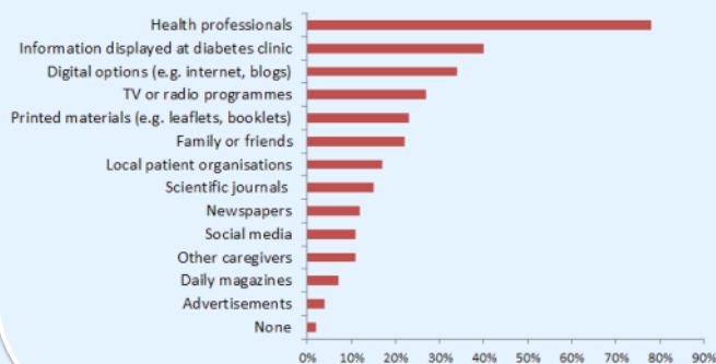
Figure 3. Main sources of CVD information

Three in four respondents relied on a healthcare professional (HCP) as their main source of information on CVD (Figure 3). Yet one in six were unsatisfied or very unsatisfied with the information received from health professionals. Furthermore, one in four respondents had never discussed or could not remember discussing their CVD risk with a HCP. Only one in four had discussed their CVD risk with a HCP at the time of their T2D diagnosis.