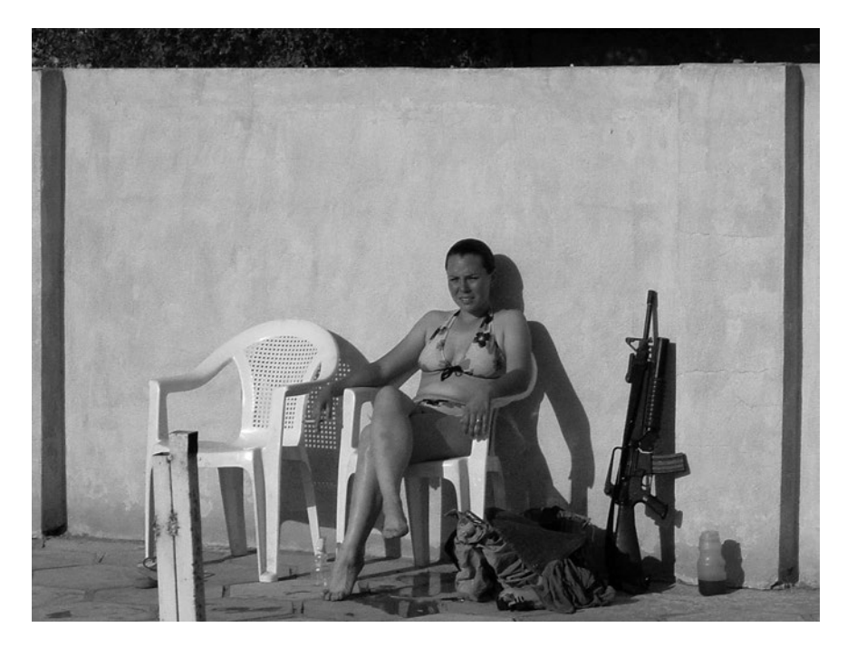
Figure 4.1 Female soldier in Iraq with bikini and rifle