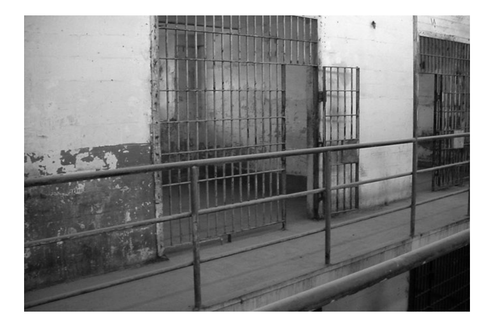
Figure P.2 Abu Ghraib prison cell