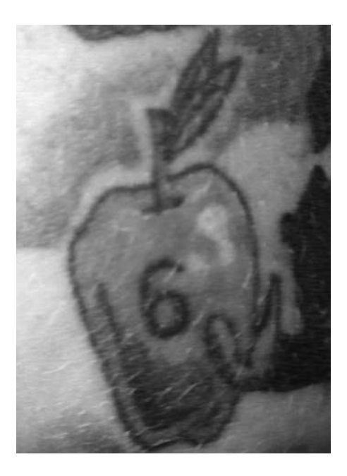
Figure 4.2 Harman tattoo, "rotten apple 6"

Note : Some of the soldiers charged with abuses at Abu Ghraib marked their bodies with variations of the "rotten apple" tattoo as a means literally to embody resistance.