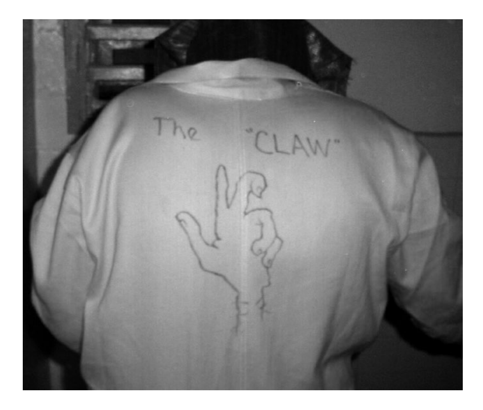
Figure 2.2 Detainee nicknamed "The Claw"