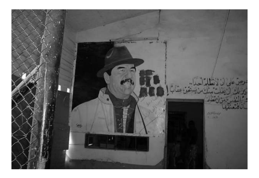
Figure 5.1 Graffiti in Iraq