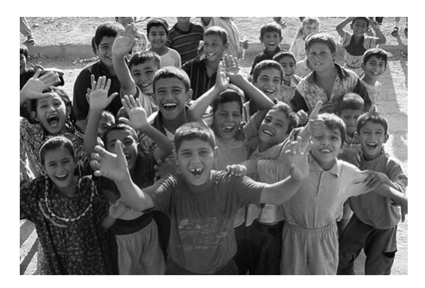
Figure 5.5 "Sabrina! Sabrina!"