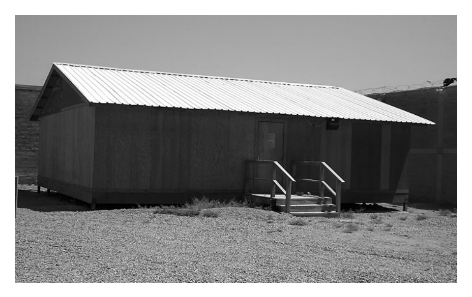
Figure 5.8 Military Intelligence Interrogation Shed, Abu Ghraib, Iraq