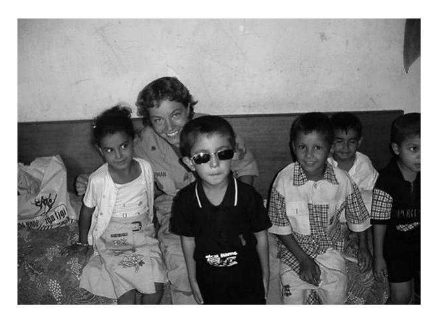
Figure 5.7 "Maternal Sabrina"