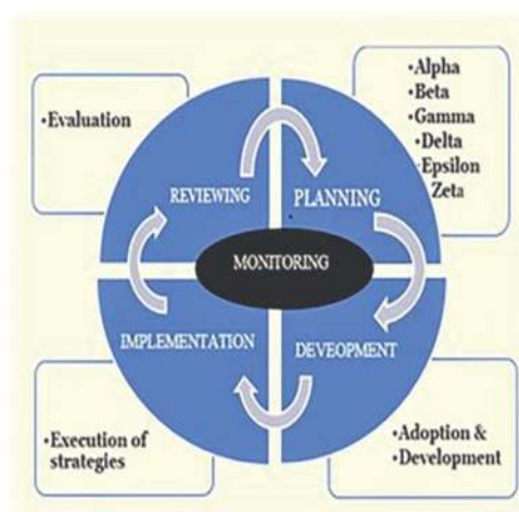
Figure 1. Framework for ICT policy process.