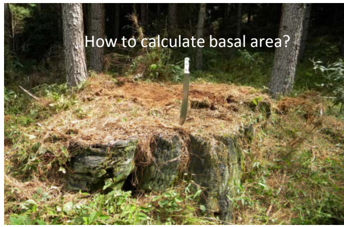
Figure 2: Hardwood stump

CONAMA – CONSELHO NACIONAL DO MEIO AMBIENTE. Resolução n° 2, de 18 de março de 1994, 1994a.