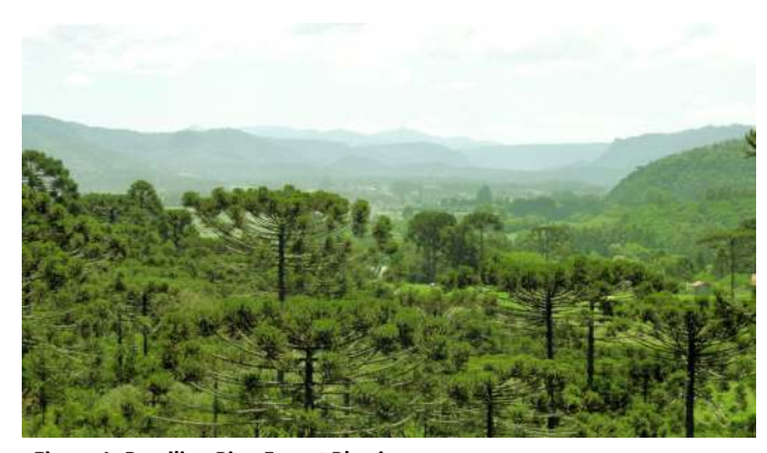
Figure 1: Brazilian Pine Forest Physiognomy