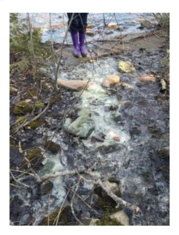
Figure 12. Views of site F. Figure shows the seepage path from site F to the lake on April 29, 2016, with white foam arising from the wooden crib.