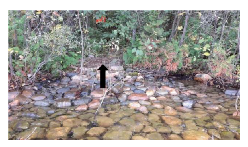
Figure 13. Views of site F. Figure from October 12, 2016, shows the shoreline of Smith's Bay, Lake Huron, with a gap in the vegetation (black arrow) and a person with orange vest standing in front of the wood crib in the background. Inspections of the rocks in the water demonstrated the presence of white particulate residue from the seep and zero SAV in this area, while adjacent areas had SAV [21].

determination was this site represented a natural hydrocarbon seep. A soil test pit survey was conducted to map the hydrocarbon distribution below grade, and chemical analyses tracked the plume 75 m upslope from the shoreline, where the survey ended. The results from this tracking exercise led to the final determination that this was a natural seep, not a lost HEA, as no evidence of infrastructure was found in the area upslope [21].