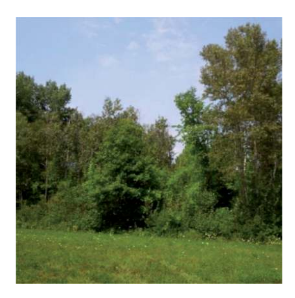
Figure 15. View of site H within a hay field on August 8, 2014. Figure shows the forest-wetland downslope of the pipe. The trees in the area were shorter (stunted) and also showed dead stems relative to adjacent areas, and EPI was evident downslope but absent from adjacent field areas.

( Oenothera biennis L.), tall buttercup ( Ranunculus acris L.), and yellow hawkweed ( Hieracium piloselloides Vill.). However, within 1 m of the pipe, EPI was dominant (>90%). At 30 cm from the pipe, the soil was bare. This pattern of reduced plant diversity and elevated EPI implies that groundwater likely rises periodically around the base of the capped pipe.