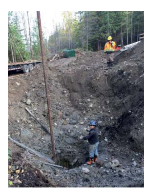
Figure 9. Views of site E with wood crib within the shoreline forest of Smith's Bay. Figure is from November 1, 2016, and shows the excavation in progress with the discovery of a barrel at \sim 5 m below grade but still 4 m above the well box [21].