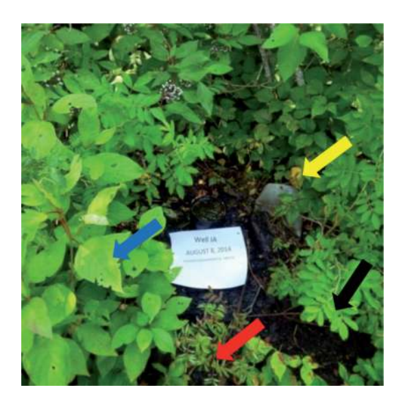
Figure 14. View of site H within a hay field on August 8, 2014. Figure shows the oil-water slurry runoff from a pipe. The vegetation near the pipe demonstrated evidence of leaf chlorosis and stunted size, including red osier dogwood that was upslope and had branches over the pipe (blue arrow), black locust (black arrow), EPI (yellow arrow), and multiflora rose (red arrow).