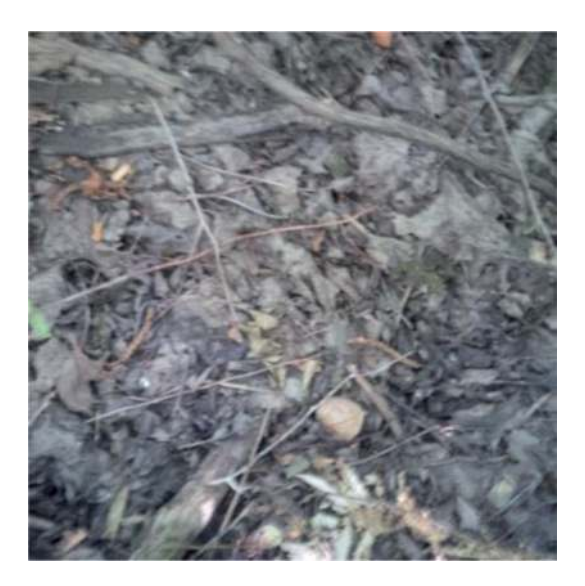
Figure 4. Views from August 2, 2016, show the groundcover and tree overstory at the rotted wood crib at site A. Figure shows a complete absence of live plants within the former wood crib.