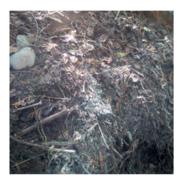
Figure 11. View of site F near the shoreline of Smith's Bay, Lake Huron, on June 29, 2016. Figure shows the path where oil-water seepage drains to the shoreline that lacks live vegetation, with white residue along the path.

balsam poplar and balsam fir directly around the wood crib. Balsam poplar growing over the wood crib has dead branches on the side of the crib and live branches on all other sides. The balsam fir that was downslope of the wood crib was short with a maximum height of <2 m, while other balsam fir upslope and adjacent areas had heights of >15 m. No eastern white cedar was evident directly downslope of the wood crib but was evident upslope with a range of heights (<1 m to 15+ m). The area directly downslope of the wood crib lacked live vegetation within an area about 1 m wide ( Figure 11 ).