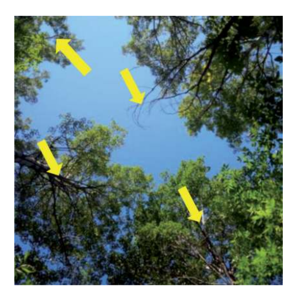
Figure 5. Views from August 2, 2016, show the groundcover and tree overstory at the rotted wood crib at site A. Figure shows dieback of the balsam poplar branches within canopy (yellow arrows) over the former wood crib. Dieback in these overstory branches indicates root death.

demonstrates bare earth along with patches of EPI and a few specimens of other herbaceous species. The overstory trees in this area are codominant balsam poplar and balsam fir; other trees in the area included red maple, red oak, and eastern white cedar away from the channel. Most balsam poplars along the channel were dead; live balsam poplar was set back from the channel and shows dead branches on the side of the channel. Also the balsam fir close to the channel is short, with a height of <2 m, while balsam fir upslope was up to ~15 m tall.