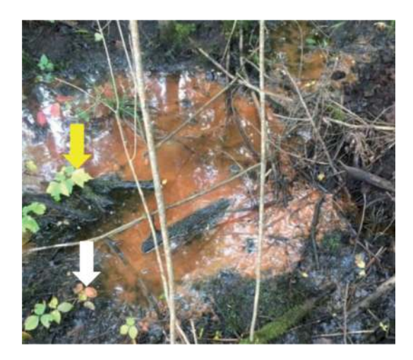
Figure 6. View of site C with iron-stained water that originates from a pipe on September 9, 2017. Figure 6 shows an area that is in close proximity to the pipe, with chlorosis evident in red maple sapling (yellow arrow) and EPI (white arrow).