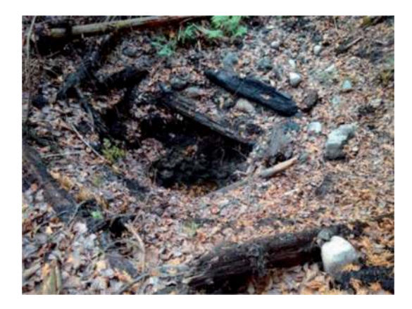
Figure 8. Views of site E with wood crib within the shoreline forest of Smith's Bay. Figure is on November 10, 2015, at the time it was found, after it was burned during 1905.

The herbaceous plant community in proximity to site E was depauperate and sparse within 5 m of the wood crib, likely attributable to the low light levels from the closed forest canopy and heavy leaf litter. Some common lady fern ( Athyrium filix-femina L.) were evident within 3–5 m of the crib along with EPI. Very few plants were evident in close proximity to the crib, except for some EPI. Balsam poplar growing over the wood crib had dead branches on the side of the crib and live branches on all other sides. The balsam fir that was downslope of the wood crib was short with a maximum height of <2 m, while other balsam fir upslope and adjacent areas had heights of >15 m. No eastern white cedar was evident directly downslope of the wood crib in the drainage path but was upslope.