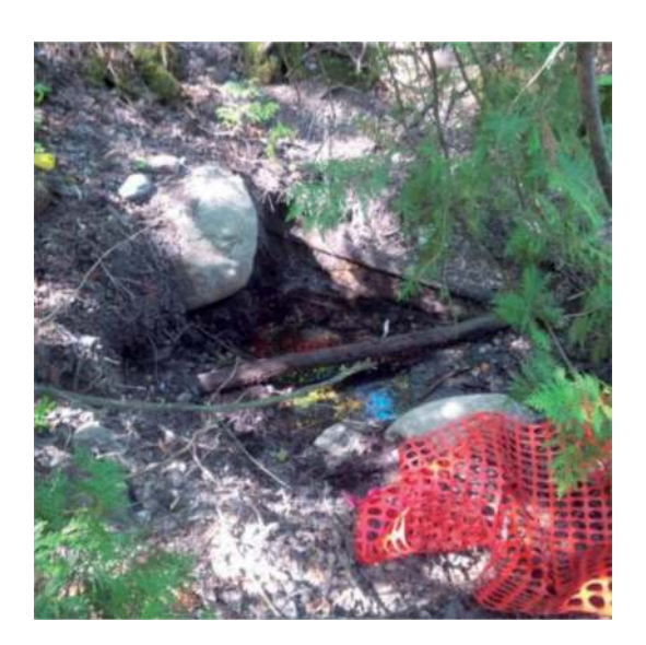
Figure 10. View of site F near the shoreline of Smith's Bay, Lake Huron, on June 29, 2016. Figure shows how the wood crib exists over a natural hydrocarbon seep, about 20 m upslope from Smith's Bay.

Site F was approximately 100 m west of site E within the shoreline forest of Smith's Bay, Lake Huron, and was about 20 m upslope from the shoreline. Site F included a wood crib that measured 1.8 by 1.8 m and contained water ( Figure 10 ). After the wood crib was removed, the area was scanned using EMI, similar to site E. This EMI scanning identified no pipes or other metal infrastructure at depth but suggested that groundwater was close to the surface [21]. During abandonment, no metal well pipe was found, but extensive volumes of groundwater were observed within 1 m below grade. The overstory trees in the area were eastern white cedar; however, no mature specimens were evident at the HEA, as it was dominated by