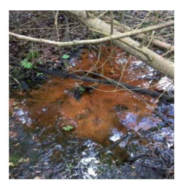
Figure 7. View of site C with iron-stained water that originates from a pipe on September 9, 2017. Figure shows an area in very close proximity to the pipe, with very low density of plants with those evident showing severely stunted size.

the channel ( Figure 6 ). For the EPI in this area, it showed a gradient of responses to exposure to channel, based on distance to the water. Eastern poison ivy specimens that were in direct contact with the water had all three leaves showing red color, while other specimens on the channel above the water line had leaves that were red on the water side and yellow-green leaves upslope of the water. The EPI away from the channel demonstrated less yellow and red color in the leaves with green color evident. In contrast, specimens of EPI found in a short distance upslope had bright green leaves with no discoloration ( Figure 6 ). The area closest to the pipe had a few very small plants evident ( Figure 7 ). It is inferred the direct contact with water is triggering the rapid onset of chlorosis in leaves. Stunted plant height is attributed to exposure of soil to brine in the past. These phenological responses to brine exposure suggest a mechanism to explain the paucity of plant species, reduced height, and low areal coverage.