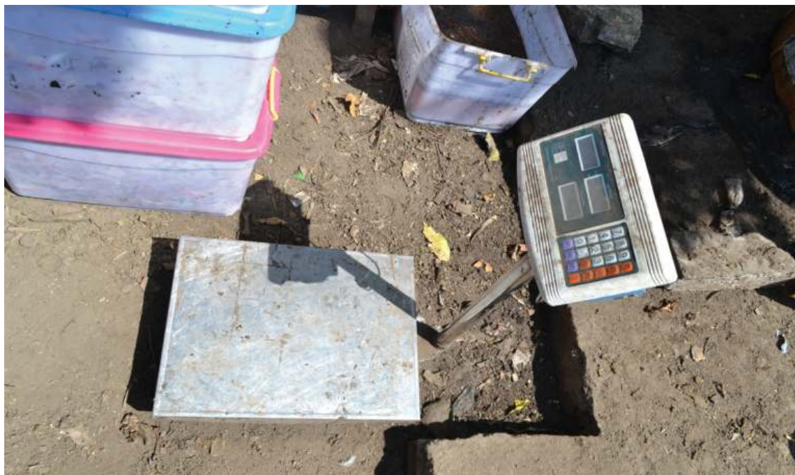
Figure 3. Weighing the waste in Bintang Sejahtera WB.

lager as a member of WB when it is needed. Bintang Sejahtera WB has cooperation with the environmental community initiative to collect waste from beaches and with the local government to provide collection system to transport the waste. It also offers seminars and trainings for local people in terms of waste treatment (composting and reuse-reduce-recycle method).