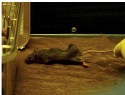
Figure 2. 20 weeks old male CNPcol2a1TG mice with kyphosis and excess growth of longitudinal and vertebral bones.

Transgenic mice that overexpress CNP ( CNPcol2a1TG ) in cartilage develop skeletal overgrowth and increased bone density: in order to further study the effects of CNP in skeletal growth and bone architecture in vivo , we generated transgenic mice by cloning human CNP cDNA (450 bp) into a construct that contained mouse collagen type II ( Col2a1 ) promoter (GenBank #m65161) to specifically overexpress CNP in chondrocytes. Growth plates of CNPcol2a1TG mice showed increased numbers of proliferative chondrocytes measured by BrdU uptake ( p < 0.05 ) and increased numbers of enlarged hypertrophic chondrocytes