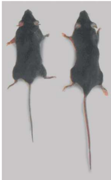
Figure 3. CNPcol2a1TG mice (on the right) are tall and slender as compared to the wild type littermates (on the left).

CNP was first isolated from porcine brain and was expected to be a neuropeptide [73], but the physiological significance of the CNP/GC-B system has been established in the vascular and skeletal systems [53, 58, 71, 72, 74–78]. It was reported that CNP and GC-B are expressed in the central [79–83] and peripheral nervous systems [84, 85]. It has been shown that the hypothalamus is an important center to control food intake and energy expenditure [86]. CNP mRNA was detected in the rat hypothalamus indicating this peptide's role in numerous