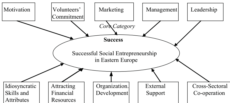
Fig. 1. Successful Social Entrepreneurship in Eastern Europe