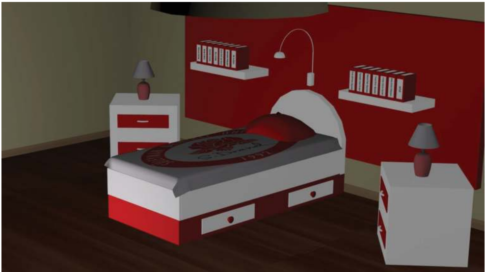
Figure 2. Teen room view.

In CHG, a teen room was designed considering digital natives preferences (Figure 2). A worktable and course books were added in the CHG room. In the computer hardware book, computer technical parts such as mainboard, processor, hard disk, RAM, video card, DVD-ROM, and