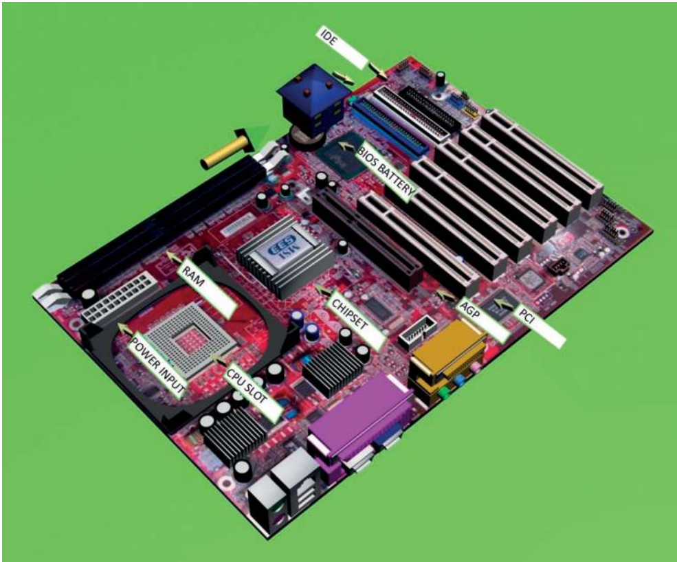
Figure 4. Mainboard view.