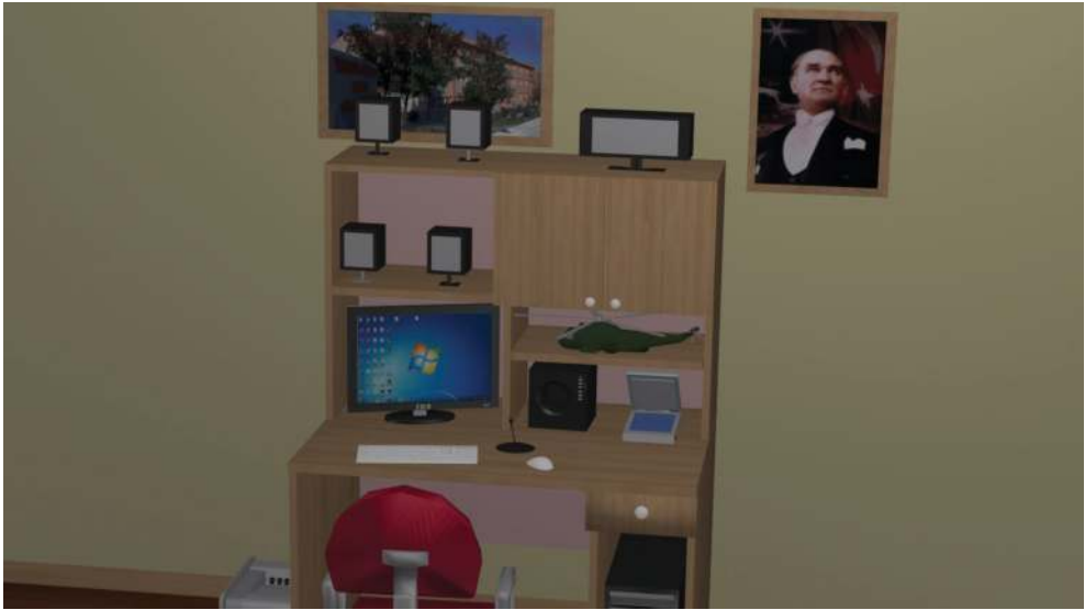
Figure 1. Computer hardware game view.

In CHG, a teen room was designed considering digital natives preferences (Figure 2). A worktable and course books were added in the CHG room. In the computer hardware book, computer technical parts such as mainboard, processor, hard disk, RAM, video card, DVD-ROM, and