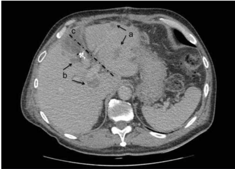
Figure 1. Postoperative CT image of a patient who underwent portal vein ligation and staged hepatectomy: (a) treated liver metastases of the FRL, (b) metastases on liver to be resected, and (c) line of liver bipartition.

and the vein is then transected. A 4–0 Prolene ® running suture is applied to the stump of the hepatic vein. Liver segment 1 is usually preserved [46].