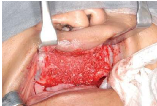
Figure 7. Adapted particulate graft throughout the cleft region. Author: Case report from Oral and Maxillofacial Department of “Defeitos da Face” Medical Center, Sao Paulo, Brazil.

The aim of this surgical approach, besides the bone graft, is to obtain throughout primary close of all the tissues layers (buccal, nasal, and palatal mucosa) (Figure 7).