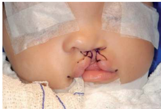
Figure 1. Patient with unilateral left lip cleft who will submitted to Millard technique. Author: Case report from Oral and Maxillofacial Department of “Defeitos da Face” Medical Center, Sao Paulo, Brazil.

The purpose of this surgery is to relocate the surrounded labial tissues: skin, orbicularis muscle of the lip and mucosa. Indeed, for removing the hypoplastic tissue from the margin of the cleft (specifically, could be or not performed, and it will