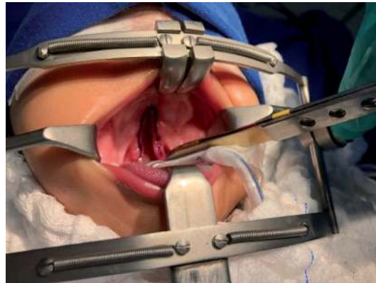
Figure 4. Post-foraminal complete cleft palate. Author: Case report from Oral and Maxillofacial Department of “Defeitos da Face” Medical Center, Sao Paulo, Brazil.

The alveolar clefts are not treated along with the primary surgeries for correction of the labial and palatal clefts. This is due to the numerous studies published that in the patients who underwent grafts called “primary” grafts in the first years of life, there was a restriction of the transverse growth of the upper maxilla than in